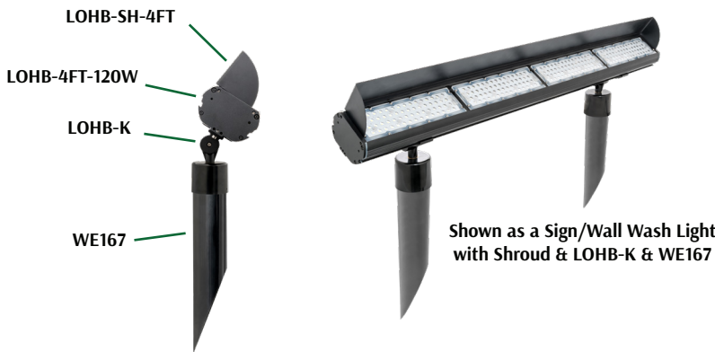
Shown as a Sign/Wall Wash Light with Shroud & LOHB-K & WE167